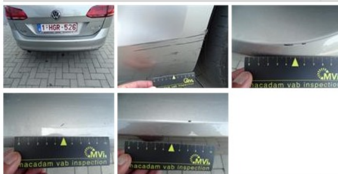
Door R L, Bump(s), PDR - Knock out without painting